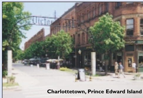
Charlottetown, Prince Edward Island

In urban areas, sustainable neighbourhood features are likely to be found in “urban villages” like the Kitsilano area in Vancouver, Fort Rouge in Winnipeg, the Beaches in Toronto, the Plateau Mont-Royal in Montreal and Spring Garden in Halifax.