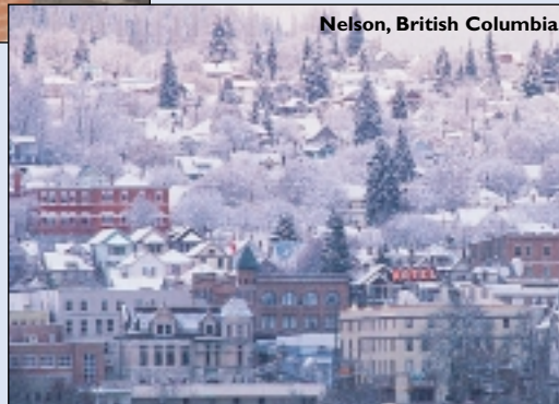
Nelson, British Columbia

In rural areas they are small towns like Nelson, British Columbia, Sackville, New Brunswick and Perth, Ontario.