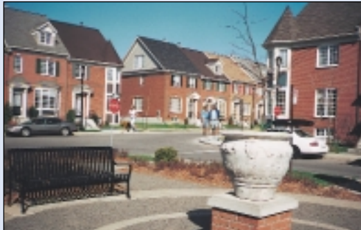
Bois-Franc, Montreal, Quebec

In suburban areas, they are places like McKenzie Towne in Calgary, Cornell in Markham, Ontario and Bois-Franc in Montreal.