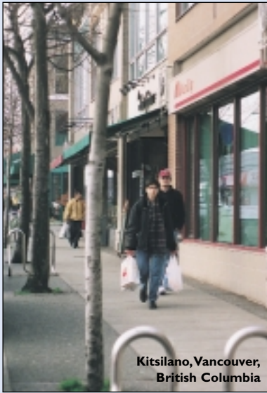
Kitsilano, Vancouver, British Columbia